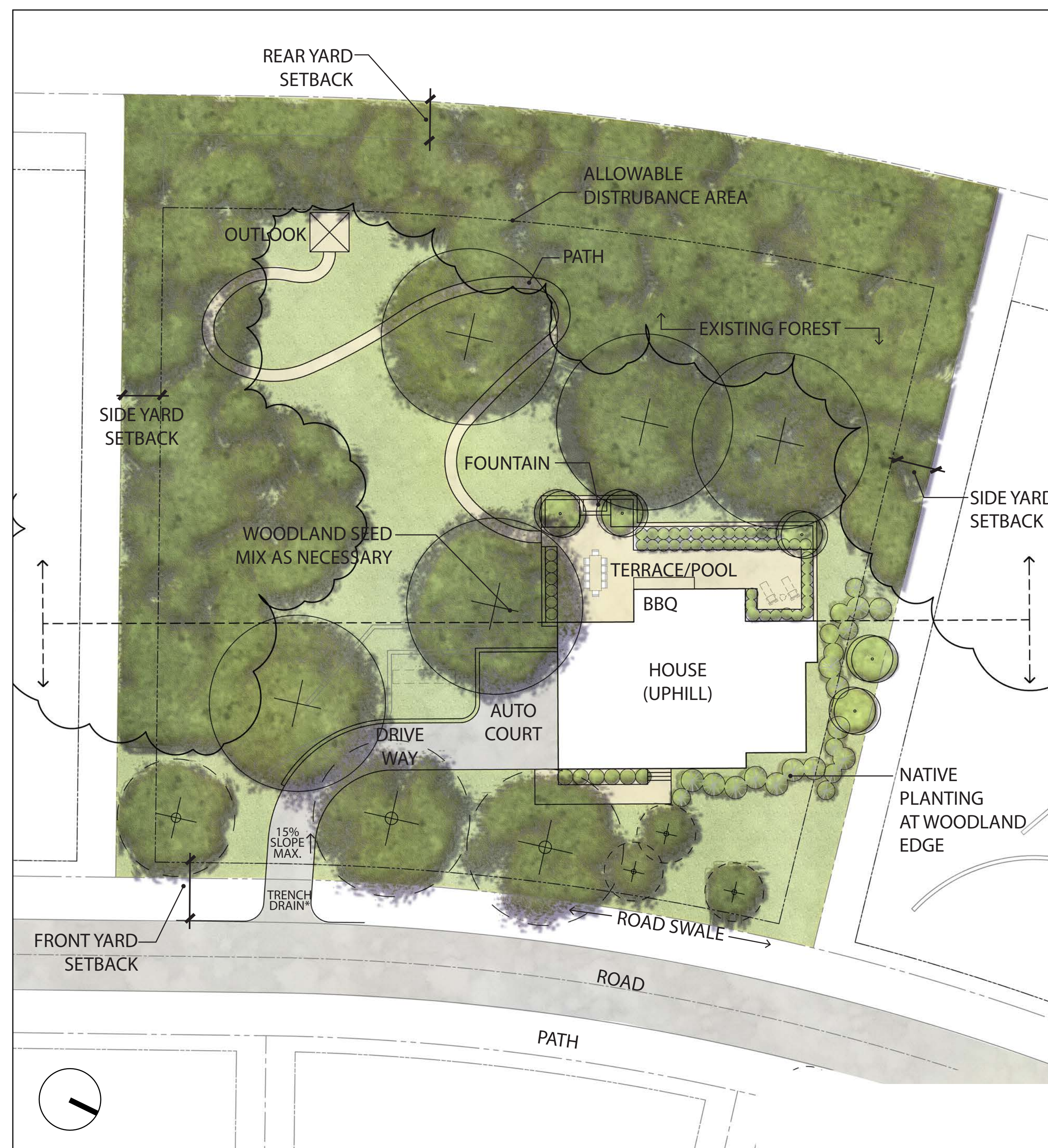
1" = 20' at full size (36 x 48")