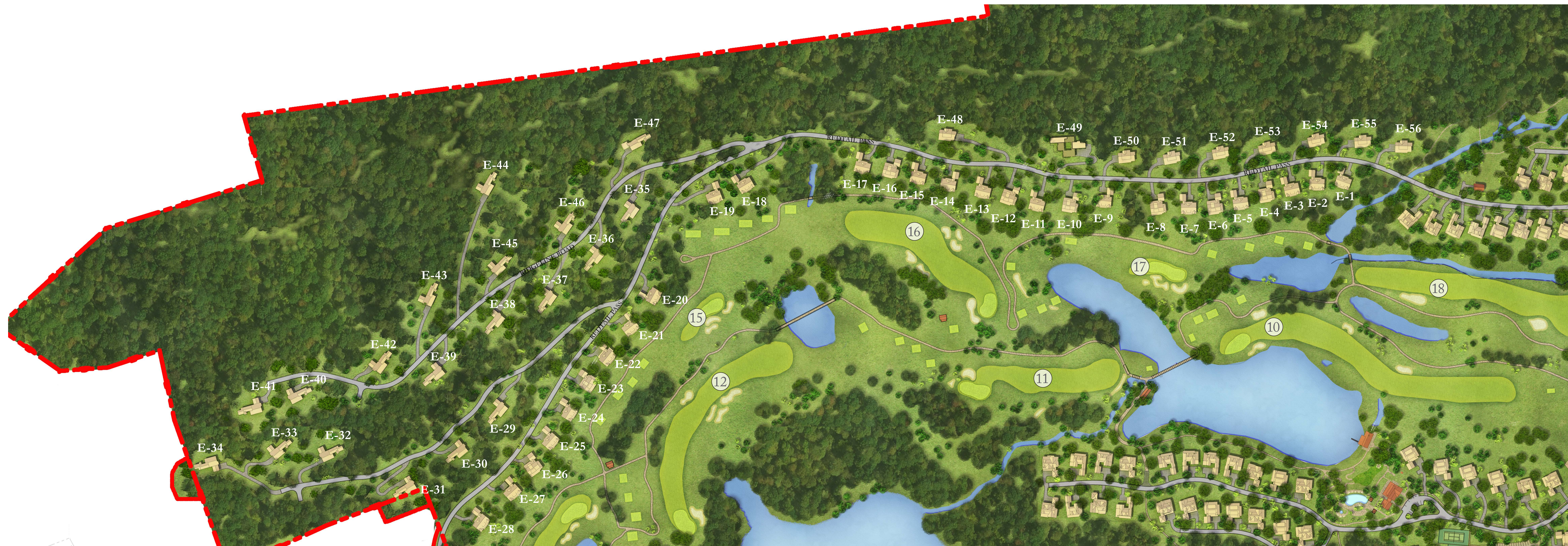
ESTATE HOMES NEIGHBORHOOD