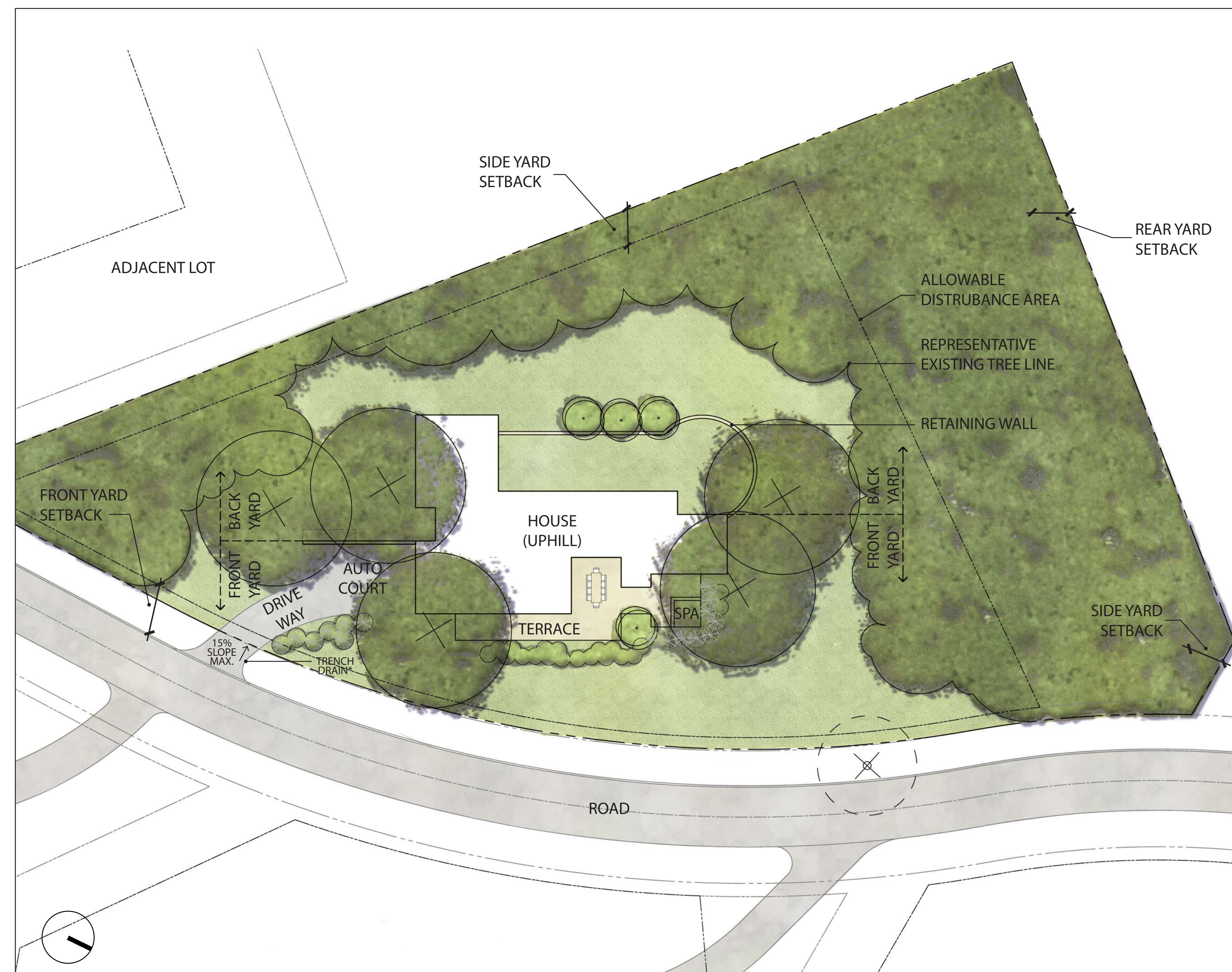
1" = 20' at full size (36 x 48")